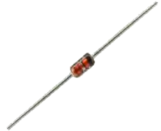
Dimensions in millimeters